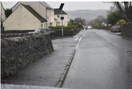
Once up and heading down into Kilbarchan return to the Weavers Cottage and turn left up new Street towards the park