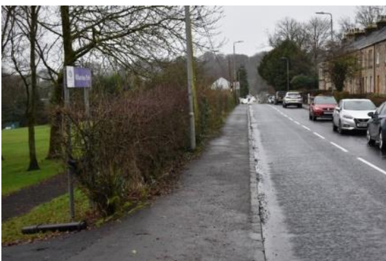
Continue pass the start of the race and enter the park at the further away entrance