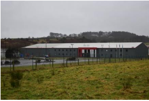
Running passed the Bridge of Weir Tannery plant

Take care on the climb up to Kilbarchan as the road narrows and has blind bends